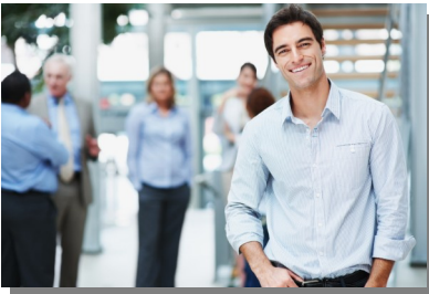
24X7 Hosted Technical Support