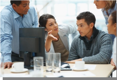
30+ Years Industry Experience