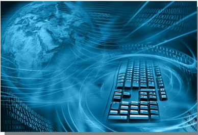
Continuous Compliance Validation